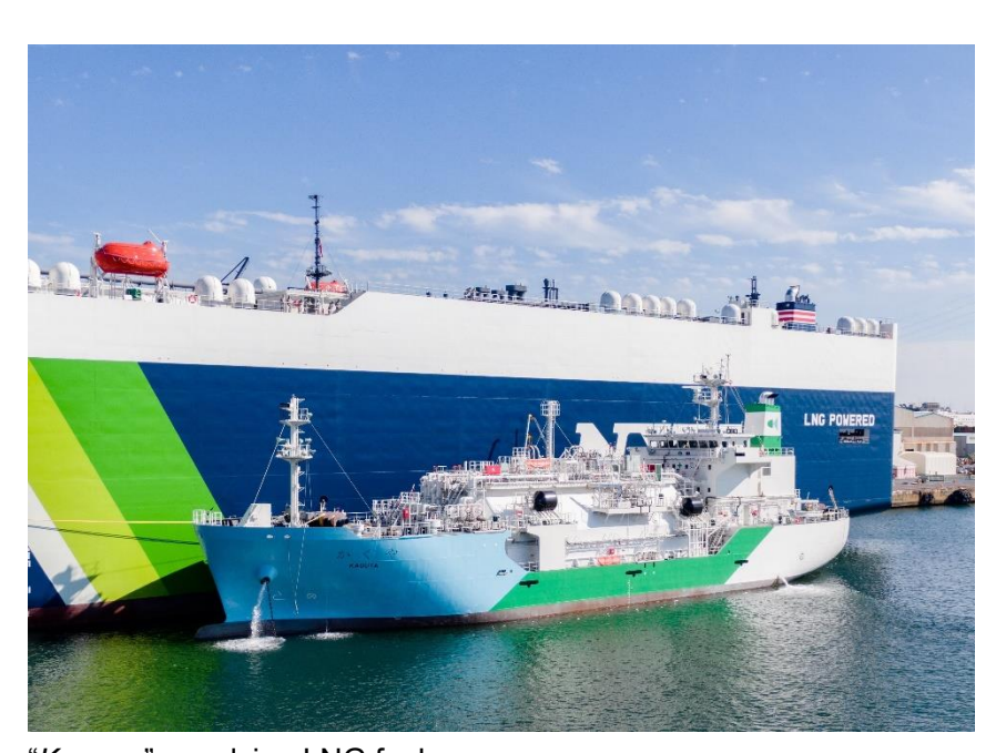
"Kaguya" supplying LNG fuel

"K" Line Group sets safety, environment and quality as key management issues and is working towards reducing GHG emissions based on its long-term environmental policy "Environmental Vision 2050" (Note 4). By expanding LNG-fueled vessels with LNG fuel bunkering business, we will contribute to the reduction of environmental burdens.